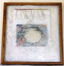
MLAA Grand Prize